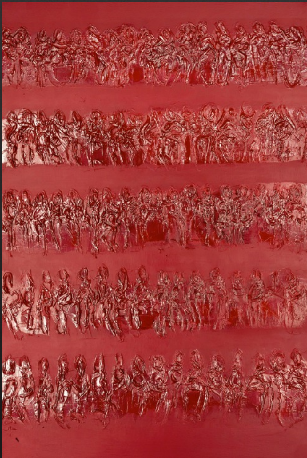
The Social RedCarpet 150x100, acrylic & other medium, 2012. (private collection Geneva)