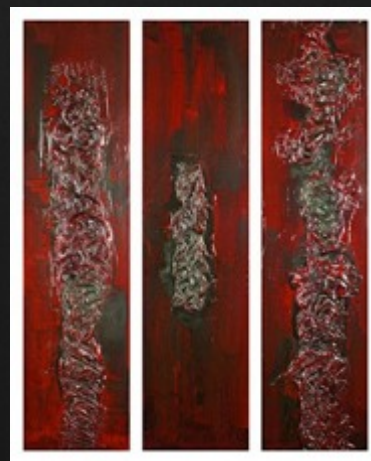
Poésie Onirique , 120x30x3, acrylic & other medium, 2012. (private collection Monaco)