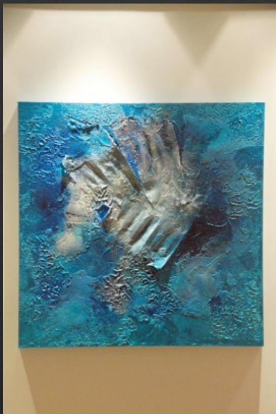
Happy Sea , 100x100, acrylic & other medium, 2012. (private collection Athens)