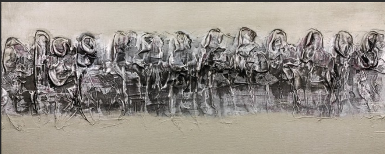
Dans la brume métallique, un écho, 100x40, acrylic & other medium, 2012.