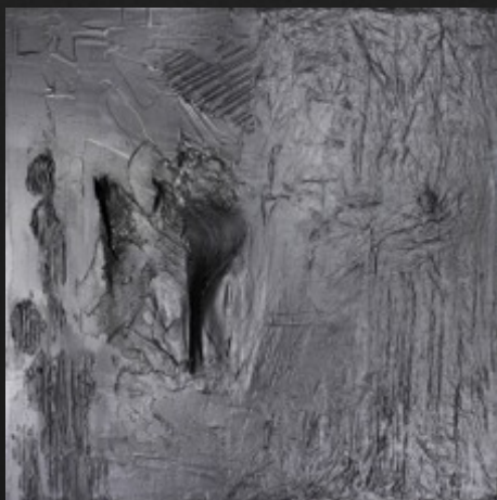
Il ne fait jamais nuit , 100x100, acrylic & other medium, 2010. (Sotheby's London)