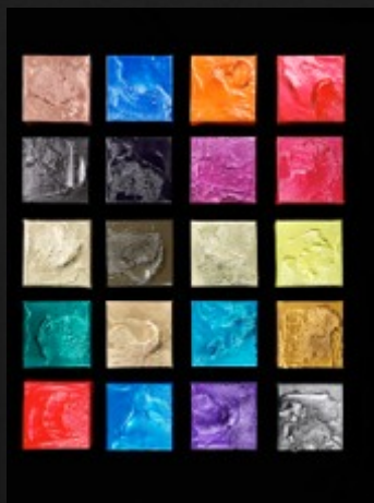
Petit Chef d'Oeuvre Deviendra Grand , 13x13, acrylic & other medium, 2010.